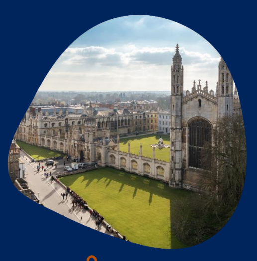
Y Kings College, Cambridge