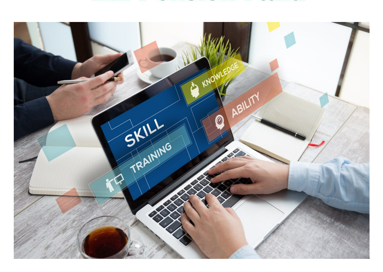
Training strategy 2022